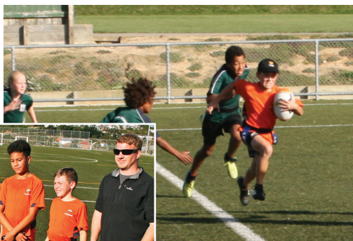
Storm King charges in the final