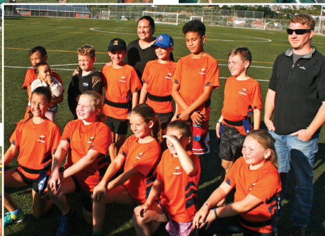
Maungaraki's Champion Wellington Regional Rippa Rugby Team 2019