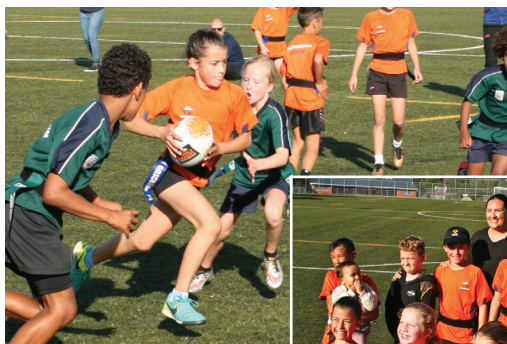
Mia Burt splits Muritai's defence

Maungaraki wins Wellington Regional Rippa Rugby Tournament Qualifies for Air New Zealand Rippa Rugby Nationals