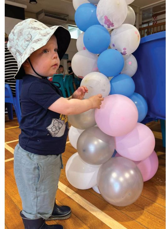
Balloons & Ice cream are a winner!