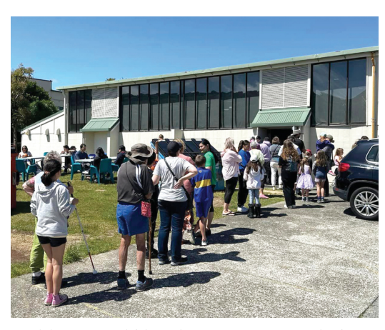
Maungaraki locals queue up for their favourite scoop of ice cream