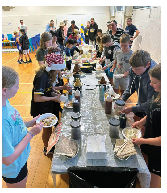
A production line of ice cream goodness

If you are considering selling your home anytime in the future, you deserve to have the best advice today.