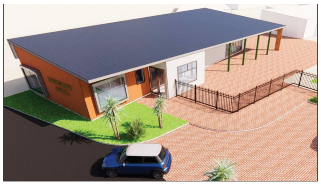
Maungaraki's new community library is currently under construction and will become a focal point of learning and activity.

This includes the installation of drainage pipes, flattening and reseeding the surface, plus an ongoing enhanced maintenance regime to keep it as good as possible. It won't be as flashy as a dedicated sports surface, but it will be a big improvement from the status quo. This installation project will start on 16 January 2023 .