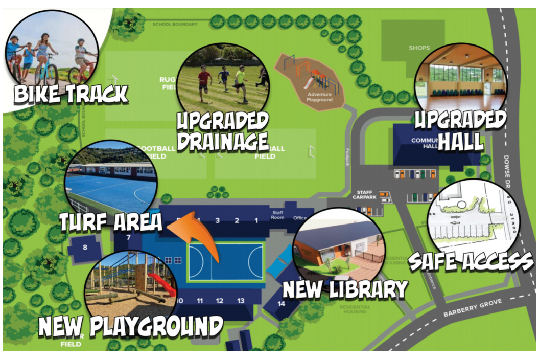
Maungaraki School is central to the new community precinct

This is a major change that many in the community have had for many, many years. The design will be like this (subject to changes in the consent process): As with the library, this was held up by significant cost increases due to the current construction environment.