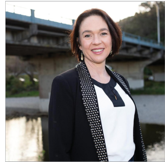
Ginny Andersen - Labour Hutt South MP & Minister of Justice and Police. Minister for the Digital Economy and Communications, Seniors, and Small Business.

The Hutt has seen more school upgrades than ever before under Labour. Hutt High was left with toxic black mold in a block of classrooms — we've completely rebuilt the block. We're also putting $67 million into upgrading Wainui High. Labour's cost of living package is for Mums and Dads, not the wealthy, and will see Hutt families benefiting from free dental care for under 30s, GST off fruit and veggies, more housing, cheaper childcare, and removing of the $5 prescription charge for medicine. Labour has been clear