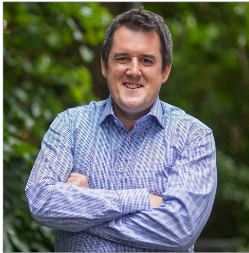
Chris Bishop - National MP, National spokesperson for Housing, Urban Development, and Infrastructure.

It will improve resilience (the 2019 Wellington Lifelines Study said that Petone to Grenada was crucial in this regard). A few years ago, it was ranked as the top transport priority for the whole region. But under Labour it has gone nowhere. It also means green field development opportunities for up to 5,200 new homes and a reduction in commuter time between Porirua and the Hutt Valley of around 30 mins return journey per day in peak travel. The Cross Valley Link is the necessary